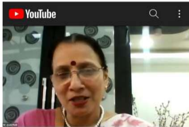
Online National Webinar on Cracking Competitive Exam MPSC/UPSC 868 views · Streamed 6 months ago

Online National Webinar on Cracking Com... m.youtube.com